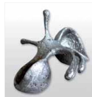
Zsófia FARKAS Little jellyfish 3 2009 aluminum 34x55x44 cm