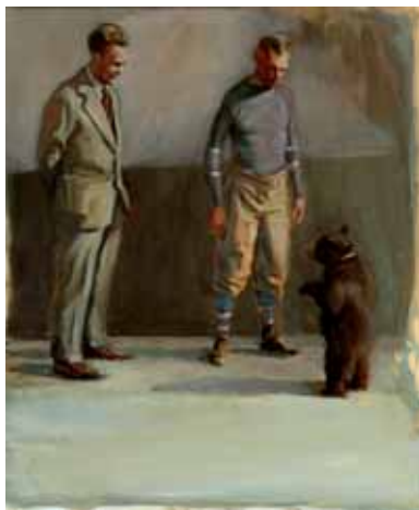
Basil DULISKOVICH Character 2012 oil on paper 60x50 cm