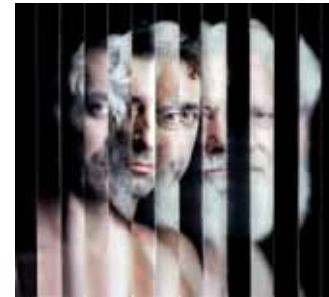
Balázs TELEK Zoltáns 2009 outstretched anamorph dyptichon edition: 1/1 + AP 37,4x29,8 cm