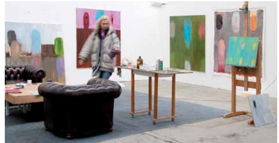
Studio: Dóra JUHÁSZ