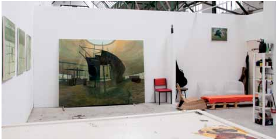
Studio: Levente HERMAN