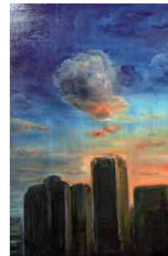
László SZOTYORY The cloud 2009 oil on canvas 100x70 cm