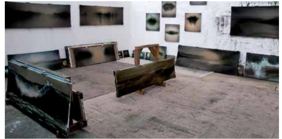
Studio: Márta KUCSORA