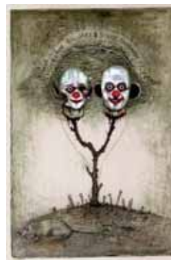
László GYÓRFFY 7x7 cardinal sins / Envy I 2010 gouache, watercolor, etching and dry point on paper 30x20 cm