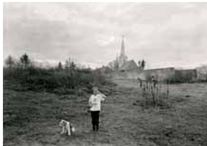
Zsolt FEKETE Matyi nephew with our dog Biri in Ikland 2004 gelatin silver prints on fiber-based baryta paper, from 4x5 inch film edition: 1/5 + AP 42x56 cm